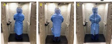
Figure 1. (A) Standard surgical gown with tie back seam (B) Surgical vest over gown back seam (C) Toga zippered seam gown

When used in conjunction with surgical helmet systems, conventional surgical gowns do not completely prevent potentially contaminated particles from entering the surgical field. These results show that removing the pathway through the back seam reduced particle escape by 45% to 49%. We recommend that staff within the surgical field cover the back seam of standard gowns with a vest or don a zippered toga style gown.